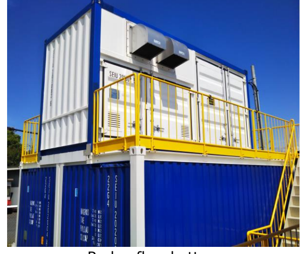
Redox flow battery

The redox flow battery system can be charged and discharged according to the output of the combined solar power generation system and the power demand on the premises. By charging power when solar power is surplus and discharging power when