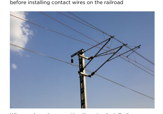
Wires and a pole supporting them to electrify the railroad