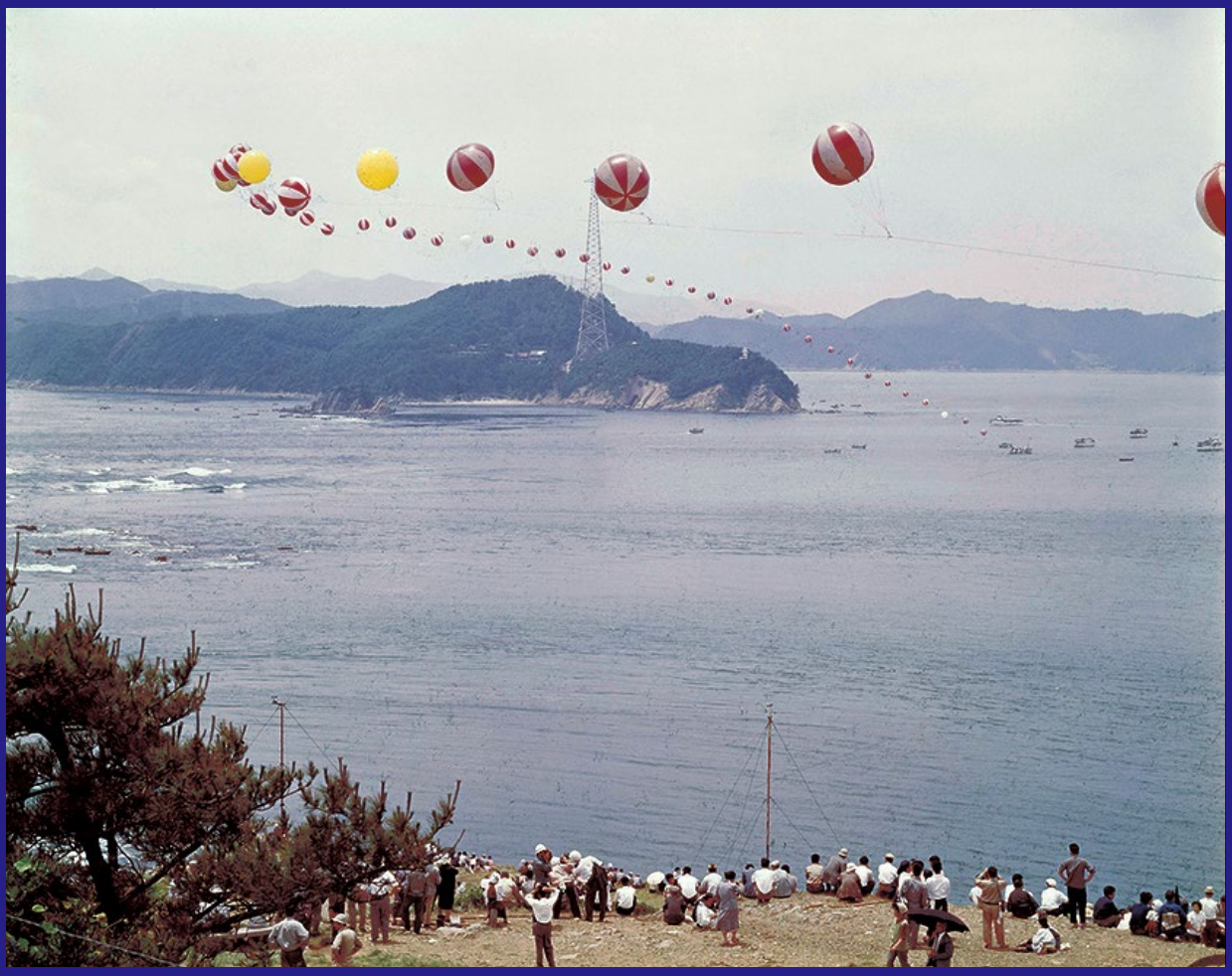
Laying a power transmission line to the opposite bank using balloons