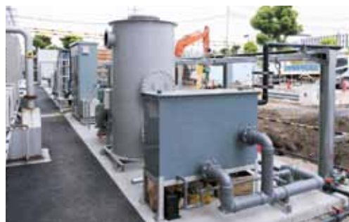
Wastewater treatment system operated in our Osaka Works

The POREFLON™ membrane-separation wastewater treatment system using the POREFLON™ module is a wastewater treatment system based on the polytetrafluoroethylene (PTFE) membrane created with the technology of the Sumitomo Electric Group. The combination of membranes enables the system to treat activated sludge at a higher concentration than the sludge treated by the conventional standard activated sludge process, ensuring the stable quality of the treated water. Chemical cleaning can be applied because the system is durable and resistant to chemicals. As a result, the burden of maintenance work can also be reduced. Another advantage of this product is that it can be designed according to the specific uses intended by the customer and its equipment. It has been installed in plants, buildings, commercial establishments and various other places in Japan and overseas.