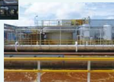
Wastewater treatment system installed in the Thailand Plant