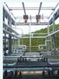
Wastewater treatment system installed in the Kisa Plant

enabled Kaihara to treat industrial wastewater in a stable manner and have substantial effects on the reduction of industrial waste, energy costs and equipment installation space.