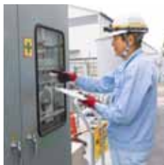
Inspection of the operational status of the system

My department engages in the design of the system at the stage of equipment establishment. We also provide after-sales services including performance checks after the installation and regular inspections, and work with customers to handle the situation concerning wastewater, which has been becoming more difficult due to regulations and other issues. For overseas customers, in particular, the system is required to have proper specifications that satisfy up-to-date local standards because the quality of treated wastewater is so significant that it can influence the operation of the plant.