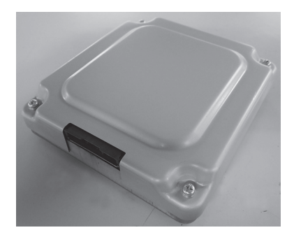
Photo1. Exterior of x-by-wire backup battery