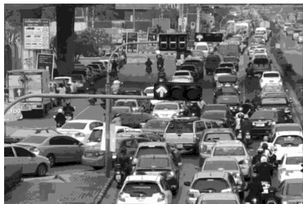
Photo 1. Road situation in Bangkok