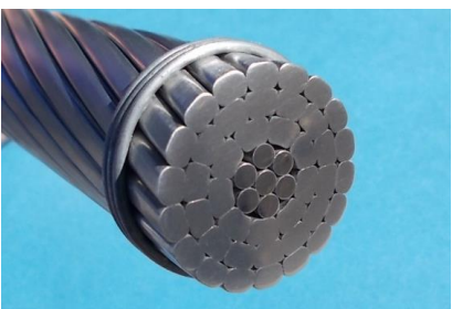
▲The low-loss high-capacity overhead conductors delivered