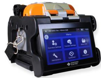
Core Alignment Fusion Splicer (TYPE-Q102-CA) Mass Fusion Splicer (TYPE-Q101-M12)